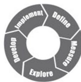
Lean Six Sigma