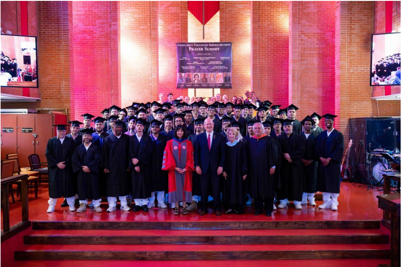
Lee College Commencement Ceremony – May 2025