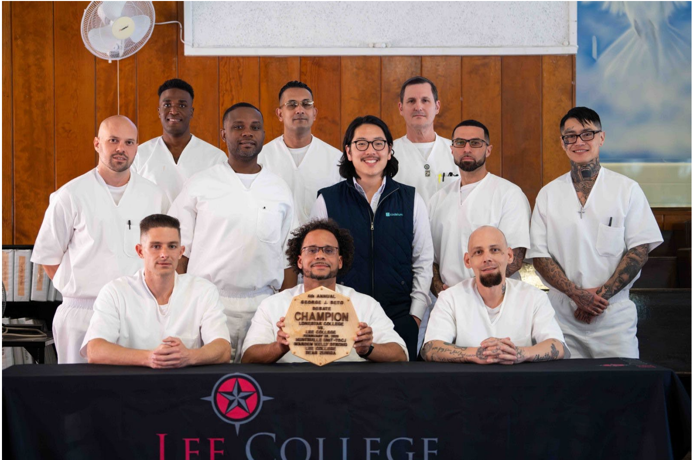
2025 Debate Team