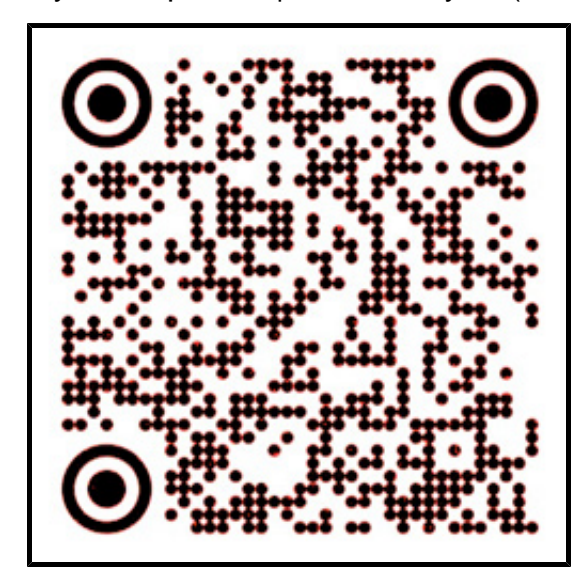
SCAN OR CLICK to visit

Information Technology Division (Tech-Voc 1) (Map) | 281.425.6451 myLC Help Desk | 281.425.myLC (6952)